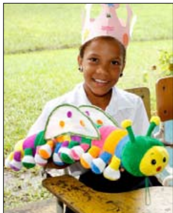
Girl with model Zippy in one of the first classes in Panama.

'The wonderful thing is that, despite their different missions and backgrounds, all these agencies are really keen about Zippy,' she said. 'I