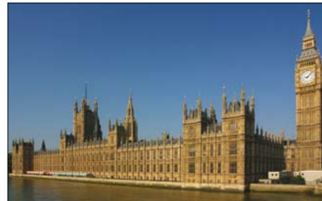
The Palace of Westminster