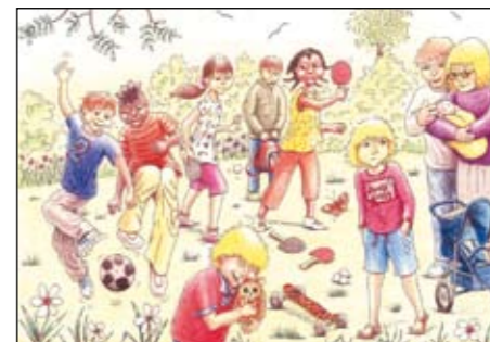
Activities for older children are being tested in Sorocaba, Brazil