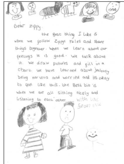
Letter from a child in Durham, England