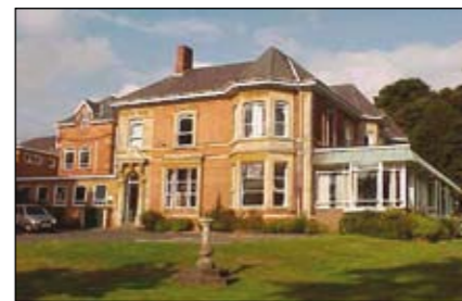
Sunfield School continued to trial Zippy's Friends for children with autistic spectrum disorders, and described its latest results as 'truly stunning'