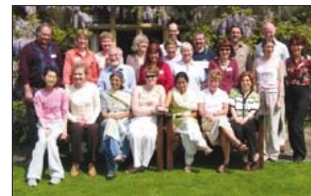
Delegates from six countries at the first Zippy's Friends international workshop