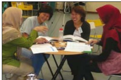
Teachers at the first Zippy's Friends training course in Singapore