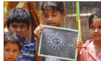
Children taking part in Zippy's Friends in Goa, India