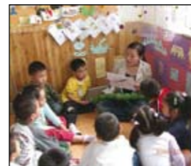
One of a growing number of Zippy's Friends classes in China's largest city, Shanghai, where our enrolment of children quadrupled last year