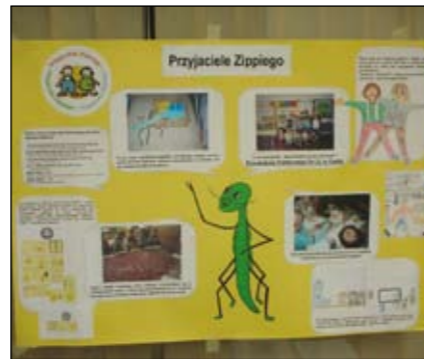
Classroom display in Poland, home to our largest European programme